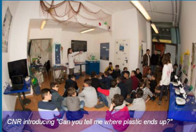
CNR introducing "Can you tell me where plastic ends up?"

This lab presented an opportunity to think about daily problems which do not receive much attention. "Can you tell me where plastics end up?" focused on discovery through practical experiences allowing participants to understand how to monitor and select tools that are used to quantify and recognise microplastics in marine waters and sediment samples. The lab showed how field sampling activities are performed and offered the possibility to do some practical and scientific trials, simulating researchers' activities, such as the separation of plastics from different matrices.