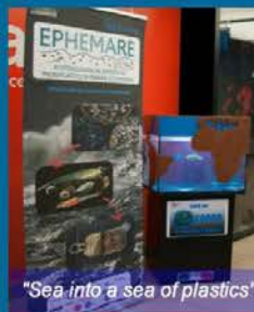
"Sea into a sea of plastics"

"Sea into a sea of plastics" highlighted problems associated with microplastics in marine environments, with particular attention to the research activities of the Regional Environmental Protection Agency of Liguria (ARPAL). The laboratory was carried out by scientific entertainers and Italian EPHEMARE partners who, through audio-video devices, engaged the visitors in different practical activities. The central focal point and setting of this lab was a specially designed tank, representing the marine ecosystem, containing plastics and marine organisms, simulating a "Sea into a Sea of Plastics". The lab represented an opportunity to address an issue of great relevance, raise questions and to find potential solutions.