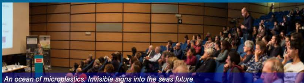
An ocean of microplastics: Invisible signs into the seas future