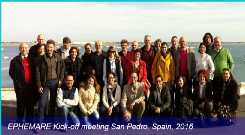
EPHEMARE Kick-off meeting San Pedro, Spain, 2016

The EPHEMARE project kick-off meeting took place in San Pedro, Murcia, Spain on the 19th and 20th of January, 2016. The meeting brought experts from Spain, France, Italy, Portugal, Germany, Belgium, Sweden, Norway, Ireland and the UK together and allowed face to face meeting with project partners, facilitating great discussions about the EPHEMARE investigation into the toxic effects of microplastics on marine organisms.