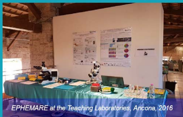
EPHEMARE at the Teaching Laboratories, Ancona, 2016

The laboratory of Ecotoxicology of Marche Polytechnic University (UPM) participated in the event "TIPICITÀ IN BLU", which was held in Ancona (19th-22nd of May 2016), to raise public awareness relating to: Blue economy and Blue growth, seafood safety and protection of the marine environment.